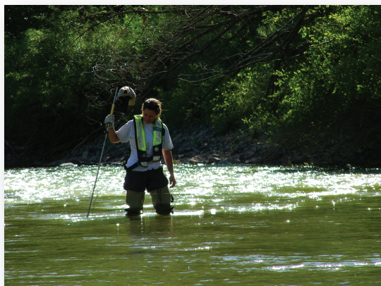
A USGS hydrologic technician wades in the San Miguel River to gather streamflow information near Telluride, Colorado.