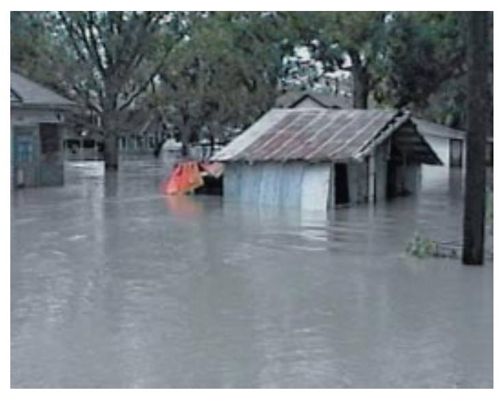
View of structures inundated by the Guadalupe River at Victoria, Tex.

During the morning of October 17, 1998, a strong low-level inflow of moist air traveling 23 to 35 miles per hour flowed from