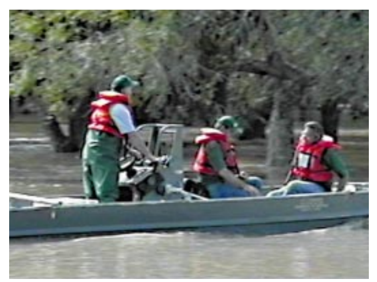
USGS personnel measuring streamflow discharge for flood at streamflow-gaging station 08188500 San Antonio River at Goliad.