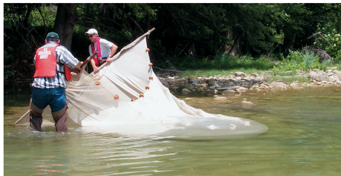
USGS biologists collecting fish for tissue analysis and community status assessment.