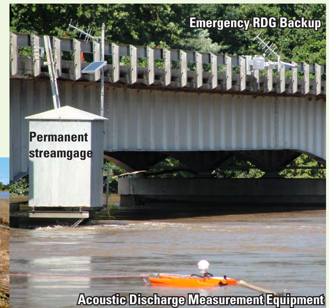
Installation on a bridge with a damaged streamgage