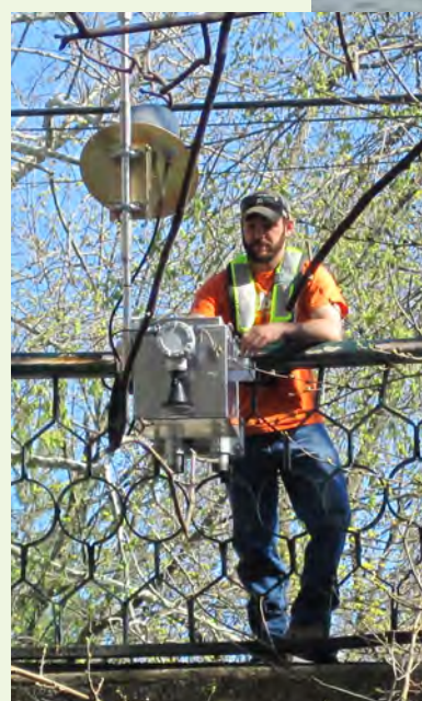
Fully assembled and installed