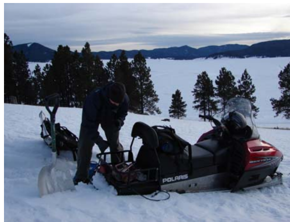
Figure 2. Waist-deep snow posed severe access problems. After one failed attempt on snow shoes the Valles Caldera National Park made their snowmobiles available to access the scintillometer.