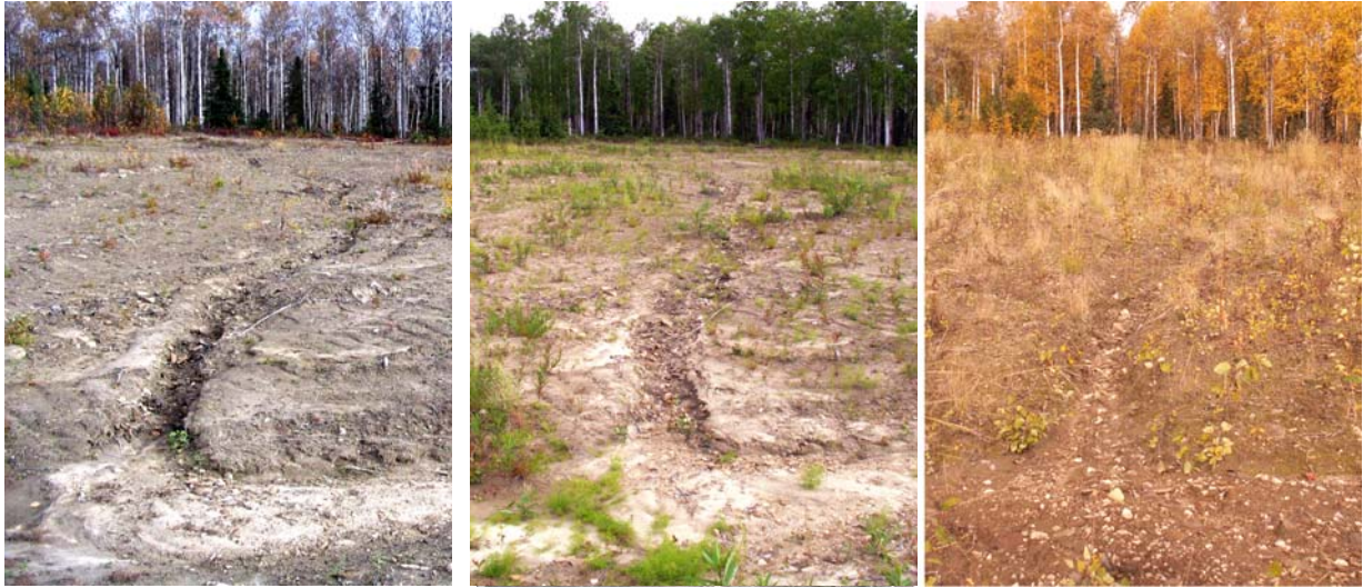
Figure 1. Landscaped evolution in the area affected by fire suppression activities; channel developed in August 2005 after rainfall events (left), channel in June 2006 (center), reestablished vegetation in August 2007 (left).