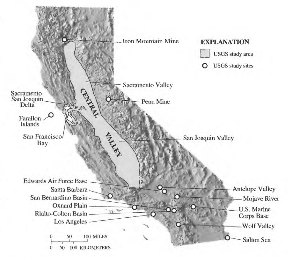
Figure 2. Selected U.S. Geological Survey water-resources study areas, California.

The San Francisco Bay/Sacramento-San Joaquin Delta system has been greatly modified by human activity. During the past 150 years, 95 percent of the tidal wetlands have been leveed and filled for development or have been converted to agricultural use. Freshwater flows into San Francisco Bay have been markedly reduced, especially during spring, because of the export of water for agricultural and urban uses to central and southern California. At the same time, water and sediment have been adversely affected by contamination from the dredging and disposal of dredge spoils, sewage discharges, and nonpoint-source urban and agricultural runoff. The biological communities also have been contaminated and greatly modified.