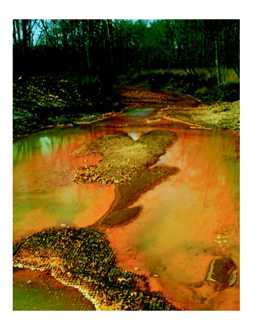
Figure 2. Stream affected by acidic mine drainage.

Acidic, metal-laden drainage from abandoned coal mines is common in Appalachia, and has had substantial effects on aquatic resources (fig. 2). The cost of correcting acidic mine drainage-related problems in Appalachia with currently available technol-