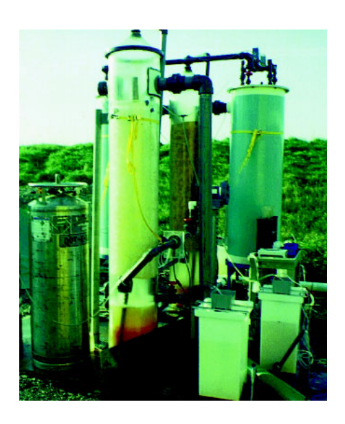
Figure 3. Apparatus developed for stream restoration.

ing with the National Park Service, the Freshwater Institute, and others to field test the technology and to determine the effects of the treatment process on acid-sensitive aquatic invertebrates and fish. Studies also are planned to identify improved methods for heavy-metal separation and sludge thickening.