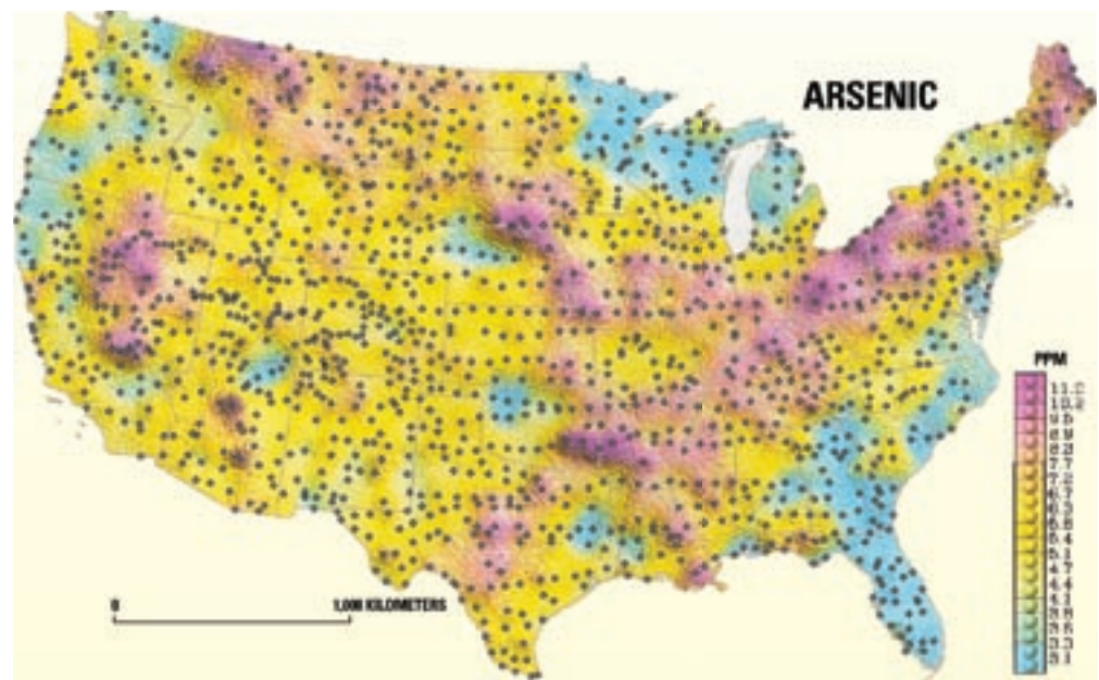
Figure 1. Map of arsenic distribution in soils and other surficial materials of the conterminous United States based on 1,323 sample localities as represented by the black dots.

The only other national-scale soil geochemical data set for the United States was generated by the Natural Resources Conservation Service (NRCS), formerly the Soil Conservation Service (Holmgren and others, 1993). This data set consists of 3,045 samples of agricultural soil collected from major crop-producing areas of the conterminous United