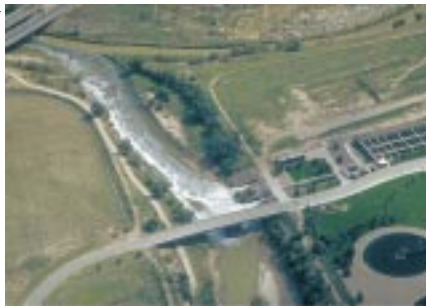
Kevin F. Demethy

discharge less toxic to fish but may not resolve problems with excessive plant growth.