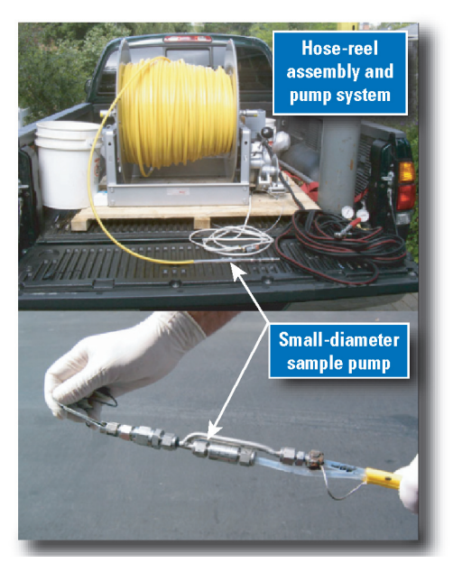
Figure 2. Photograph showing a) hose-reel assembly and b) small-diameter sample pump.

To force additional water into the sample line, pressure is alternately applied and released on the pressure line at the surface using compressed gas regulated through a control panel built by the U.S. Geological Survey. The column of water in the sample line can be forced upward to the surface through the sequential application and release of pressure. Alternately, when sufficient volume is accumulated, water in the sample line can be forced to the surface using compressed gas. With proper use, water from the pump is suitable for analysis for a wide variety of constituents, including volatile organic carbon and dissolved gasses. The pump is capable of lifting water from depths as great as 1,200 feet. The pump and hose are mounted on a motorized reel (fig. 2).