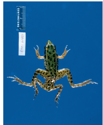
Figure 2. Deformed frog captured during a study of deformities and disease in amphibians.

The USGS's National Wildlife Health Center, in Madison, provides Federal and State land-management agencies with information, technical assistance, and research on national and international wildlife disease and health issues. USGS scientists have forged strong partnerships with several Wisconsin programs including the University of Wisconsin-Madison, University of Wisconsin-Stevens Point, the DNR, and private entities such as the International Crane Foundation. This unique facility is equipped with state-of-the-art disease-containment laboratories designed to meet the criteria established by the Centers for Disease Control and the National Institutes of Health for working with all but the most infectious agents. The Center has a national mission to monitor and assess the impact of disease on wildlife populations; investigate the ecological relationships leading to the occurrence of disease in freeranging wildlife; and provide on-site support for wildlife disease emergencies, as well as guidance, training, and technical information for reducing wildlife losses when outbreaks occur. Current Wisconsin activities include mortality investigations of wolves, bald eagles, and trumpeter swans for the Wisconsin DNR; collaborative