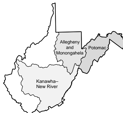
Figure 2. National Water Quality Assessment Program study units in West Virginia.

The New River Gorge National River was established by the U.S. Congress in