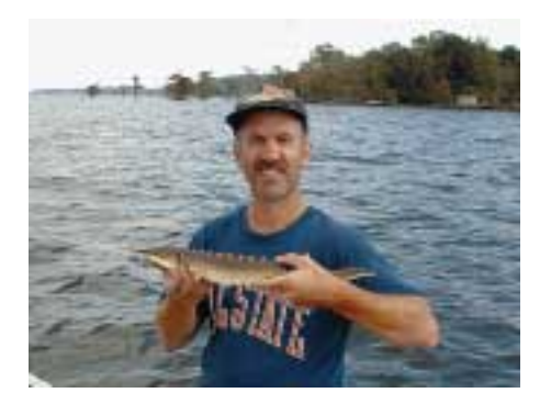
Figure 7. Atlantic sturgeon returning to North Carolina.

The USGS North Carolina Cooperative Fish and Wildlife Research Unit is studying Atlantic sturgeon population, growth, and habitat. Fish are caught and tagged, either with conventional tags or transmitters, and then released and tracked. USGS research results suggest that adult Atlantic sturgeon are very rare, but 1year-old Atlantic sturgeon appear to be abundant in western Albemarle Sound near the mouth of the Roanoke River. Genetic studies conducted by collaborating researchers indicate that this is a distinct population from that of other East Coast rivers. The juvenile sturgeon in this area appear