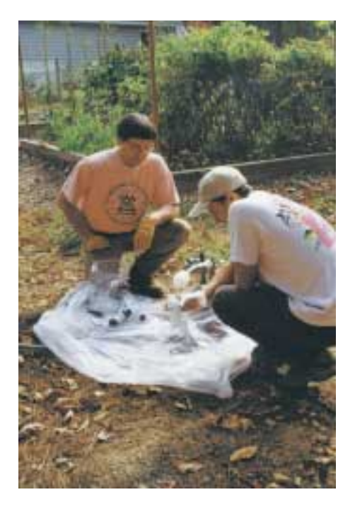
Figure 5. Sampling ground water for radon in Guilford County.

basins in Guilford and Orange Counties ranges from 100 to 700 gallons per day per acre.