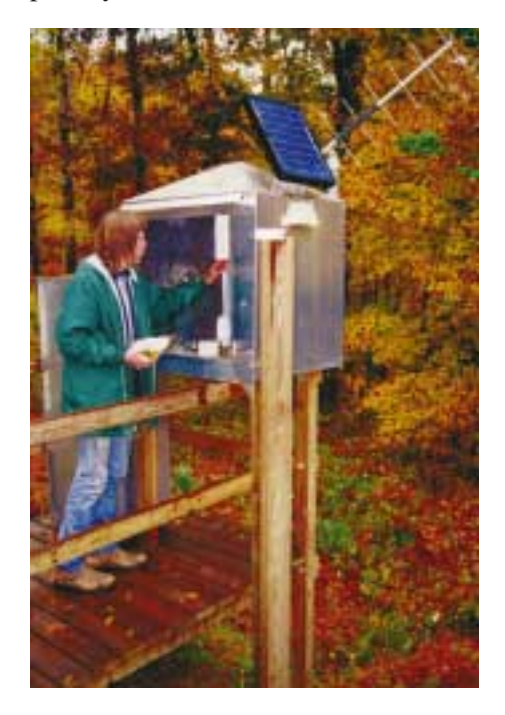
Figure 1. Satellite-linked stream gage on Crabtree Creek in Raleigh.

For more than 100 years, the U.S. Geological Survey (USGS), in cooperation with the North Carolina Department of Environment and Natural Resources (NCDENR), the U.S. Army Corps of Engineers (USACE), and other cooperators, has provided streamflow data to the citizens of North Carolina. The World Wide Web now makes it possible to deliver more data faster. The North Carolina USGS Web site at http:// nc.water.usgs.gov/ provides access to project information, publications, and near real-time streamflow and water-quality data. Monthly use of the Web site increased from 3,500 in July 1995 to more than 120,000 in July 1998, with as many as 12,000 requests for information automatically answered by Web information per day.