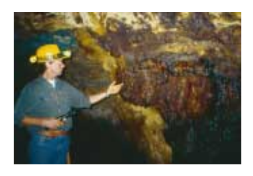
Figure 8. Stalactites, formed by iron oxide from acidic drainage, in the abandoned Fontana copper mine, Great Smoky Mountains National Park.

The USGS is helping the National Park Service address issues related to natural acidic rock and acidic mine drainage associated with abandoned mines in the Park. Acid rock and acid mine drainage are associated with a shaly rock belt that extends from southeastern Tennessee into western North Carolina. These rocks host world-class copper deposits near Ducktown, Tenn., and less wellknown deposits in the Great Smoky Mountains National Park in North Carolina. The host rocks contain pyrite (fool's gold) and the related mineral pyrrhotite, natural acid producers that can adversely affect stream trout populations. Comprehensive geological and geochemical studies are providing information about the factors that control drainage and the effects of these acids on surrounding aquatic ecosystems.