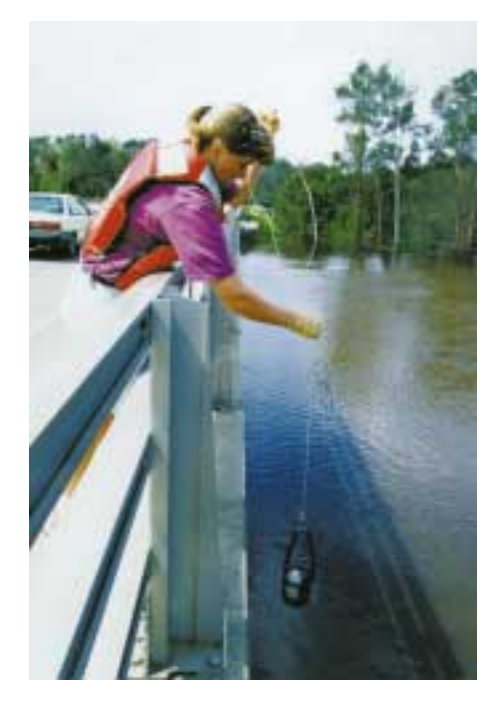
Figure 6. Collecting water samples in the Neuse River.

and phosphorus concentrations would be required in the Neuse River.