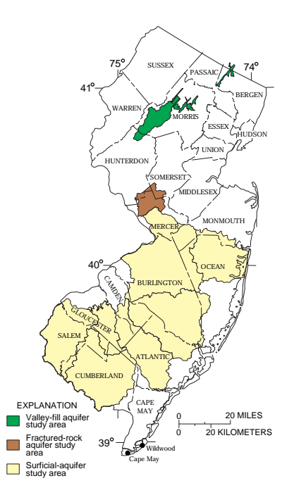
Figure 1. Location of aquifer study areas.

Many USGS water-supply studies have focused on fast-growing areas of northern New Jersey. Intensive water-resource assessments were conducted in the Ramapo River Basin in Bergen County and the Rockaway River, Lamington River, and Green Pond Brook Basins in Morris and Hunterdon Counties (fig. 1), where valley-fill aquifers and surface water are used extensively for water supply. The ground-water-flow model developed for the ground-water-resource assessment in the Lamington River Basin was later used to delineate the areas that