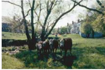
Figure 4. Cows and condos compete for the same land.

This cooperative project, between the Conservation and Survey Division (CSD) at the University of Nebraska-Lincoln (UNL) and the USGS, is preparing surficial materials maps that are intended to help planners and others address urban, ground-water, and agricultural land-use issues as well as help them evaluate geologic hazards and constraints in this area.