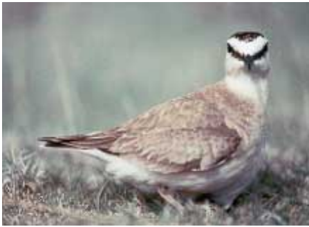
Figure 3. Mountain plover.