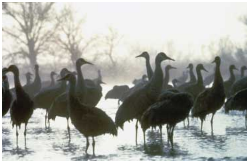
Figure 1. Sandhill cranes prefer unobstructed river channels as roosting sites.

on the role of the Platte River ecosystem as an important site for fat acquisition for migrant cranes and waterfowl. Scientists are studying how competition from growing numbers of geese, habitat loss, and increasing efficiency of corn harvesting techniques contribute to the declining rate of fat storage in cranes. Biologists are tracking cranes marked with satellite transmitters to determine how long individual cranes stop at the Platte, where they breed, and where they winter. This will provide a better understanding of their habitat needs and the role of the Platte Valley in supplying those needs. A companion study is addressing the diets, activities, and acquisition of fat and protein by lesser snow geese, greater white fronted geese, and northern pintails during spring migration in Nebraska. Biological information will be incorporated into ongoing geologic and hydrologic models of the Platte River