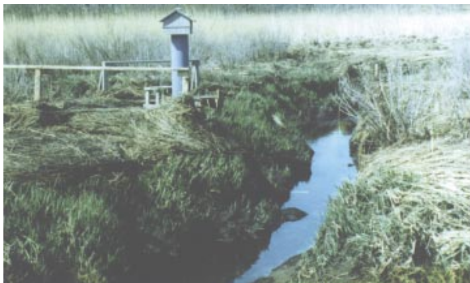
Figure 1. Automated water-level and water-quality monitoring station at Namskaket Marsh, near Orleans, Cape Cod, Massachusetts.

As part of its Toxic Substances Hydrology Program, the USGS is studying the movement of contaminated ground water that emanates from the Massachusetts Military Reservation (MMR), on Cape Cod, and the complex interaction of hydrologic, chemical, and microbial processes that occur in the contaminated aquifer that underlies the site. Computer models of ground-water flow developed by the USGS for the MMR area were useful to the National Guard Bureau in planning a program to halt the advance of contaminated ground water in seven other areas on the MMR.