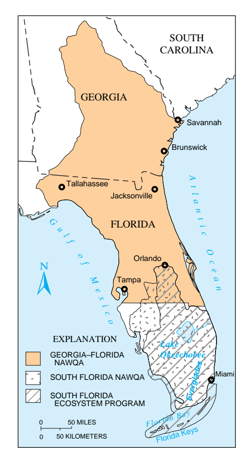
Figure 1. Study areas of the Georgia–Florida Coastal Plain and the Southern Florida National Water-Quality Assessments (NAWQA) and the South Florida Ecosystem Program.

organic and trace-metal contamination. A surface-water-quality sampling program at 7 sites within the study area and a ground-water sampling program of 30 shallow wells completed in the Biscayne aquifer and which are within a residential area in southeast Florida have been initiated.