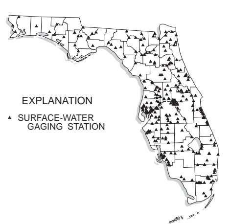
Figure 2. The locations of active long-term daily streamflow-monitoring stations in Florida.

In 1995, the USGS conducted about 50 hydrologic studies, most of which can be categorized as problem-oriented appraisals and applied research. These include, by broad categories, 21 studies to determine the availability of regional water resources for population growth management planning, 17 studies for assessment of water-quality degradation, and 13 research studies on such topics as loss of water to the atmosphere by evaporation and plants, hydrodynamics and chemical modeling of ground- and surface-water flow, and wetland processes—all of which are important to water-resources management.