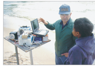
USGS hydrologist demonstrates collection of ground-water data

Comprehensive, long-term data bases are needed to support management of the Nation's resources for ground-water. Data-related priorities for the Ground-Water Resources Program include 1) improved water-level monitoring of major aquifers, 2) greater access to ground-water data through the Internet, and 3) development of systems for storage and presentation of the three-dimensional extent of aquifers and their hydrologic characteristics.